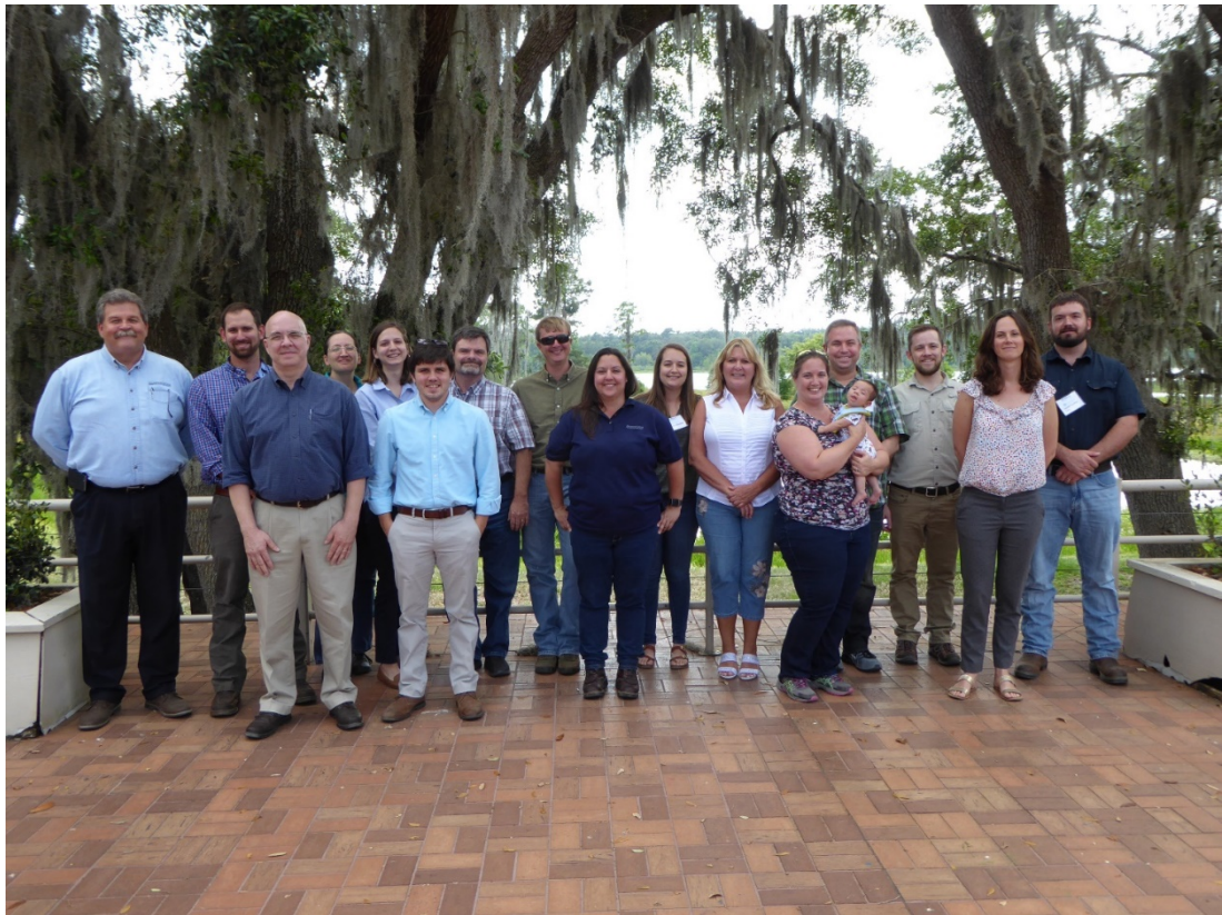
Participants: Leadership, Communication, and Conflict Management Training (see Appendix B for participant list)