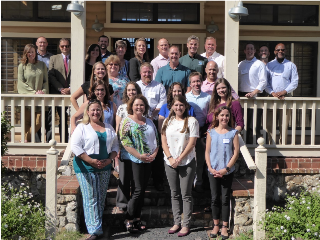
Participants: Effectively Engaging DEP Stakeholders Training (see Appendix B for participant list)