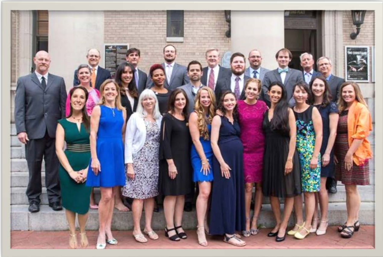
NRLI Class XVII Fellows and Project Team members at graduation, Friday, April 20, 2018, Gainesville, Florida.