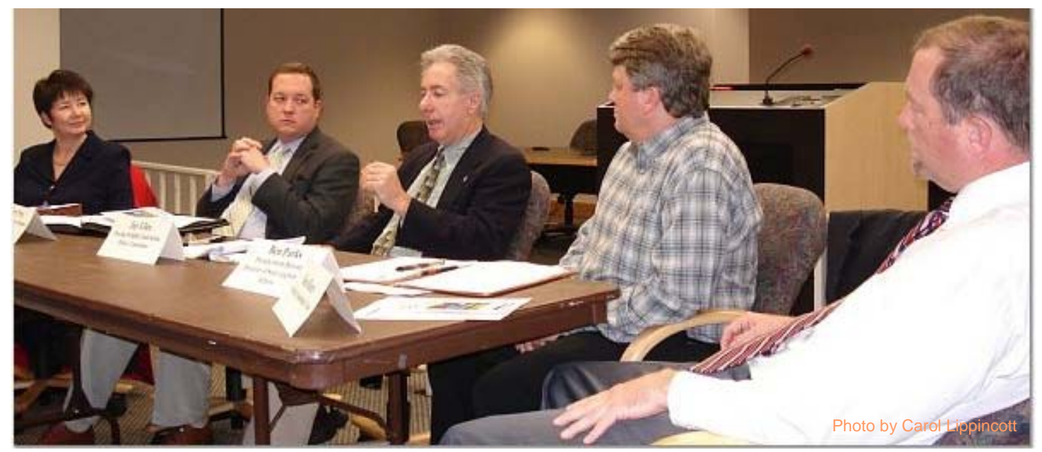
Diverse panel of legislative lobbyists discusses consensus building.