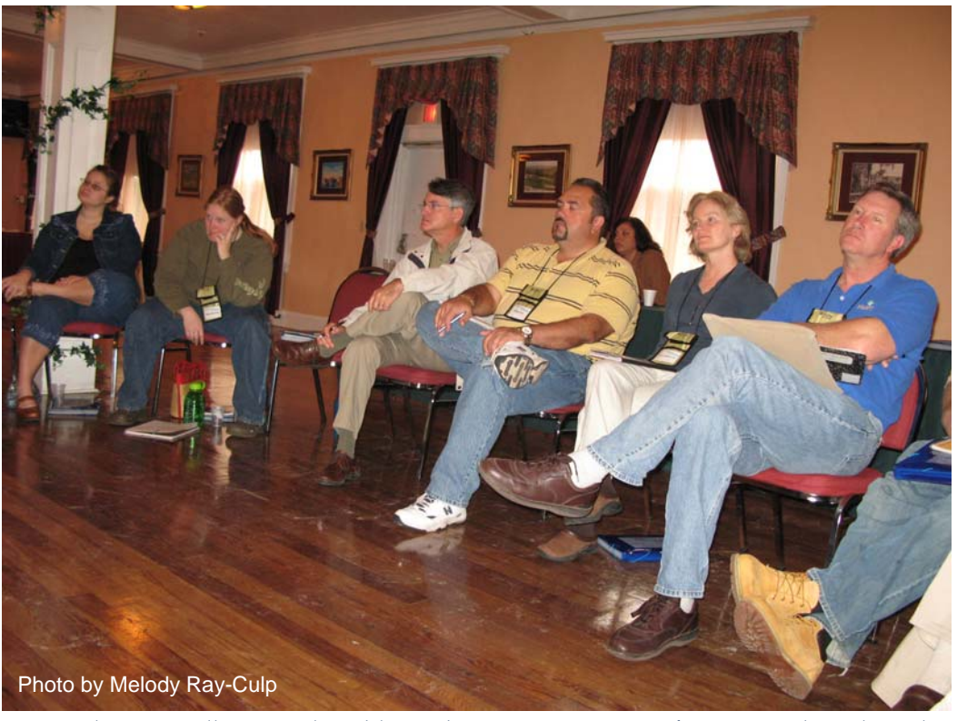
NRLI Class VIII Fellows watch and listen during a presentation of Session I. Throughout the year, they will be confronted with conflicts and asked to be leaders that will make resolutions.