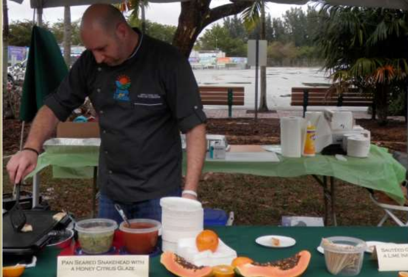
PAN SEARED SNAKEHEAD WITH A HONEY CITRUS GLAZE