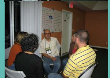
Fellows work together in groups to discuss the assigned reading.