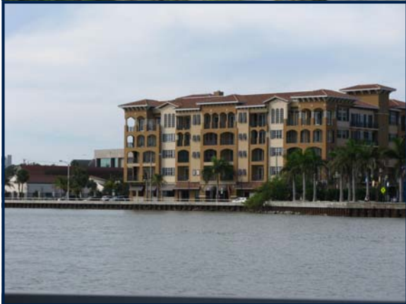
Above top : With infrastructure in place, portions of Bent Creek Subdivision stands vacant. Above: Harbour Isle, a condominium community on Hutchinsonson Island, is experiencing the effects of foreclosure with many vacant units..