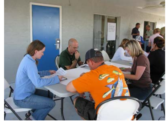
As part of the experiential learning process, NRLI Fellows work in small groups to design and develop an effective agenda using the tools given them by the Project Team.