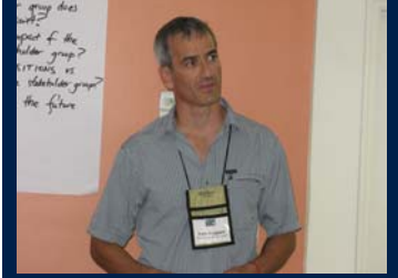
The stakeholder session took on a different look as Fellows use their interviewing skills to find out the stakeholder participants views on the "Boom to Bust" issue.