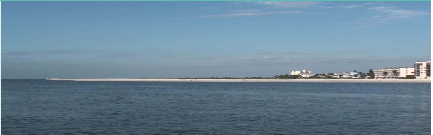
Pictured Above: Carlos Point.