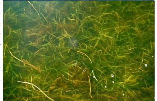
Top: One of the proposed boat ramps the county is proposing to open to the public. Bottom: Sea grass bed near the mouth of the Steinhatchee River.