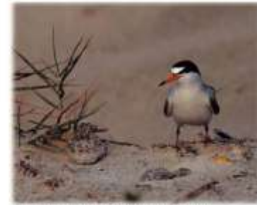
Least Terns, a threatened species, lay 4-5 eggs in a shallow scrape in the sand.

Flushing birds off nests exposes eggs and chicks to the sun and predators. Watch where you step. Eggs and young of shorebirds are not easy to see. Can you find the chicks in these two photos?