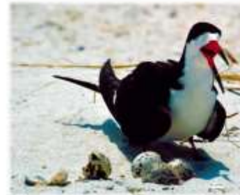
Black Skuas, a species of gull, lay 7-9 eggs in a shallow scrape in the sand.

Avoid walking near posted nesting areas.